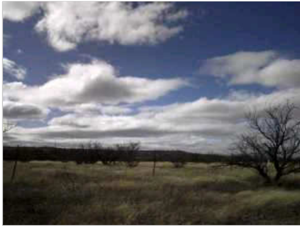
Pasture & frontage