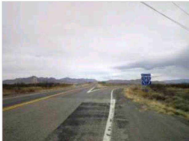
I-10 & 191