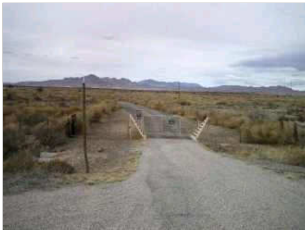
Ranch Entrance off of I-10